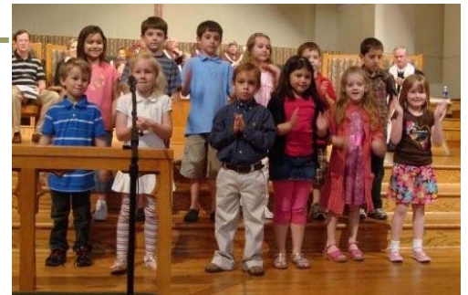
Covenant Kids worshipped with us in song.