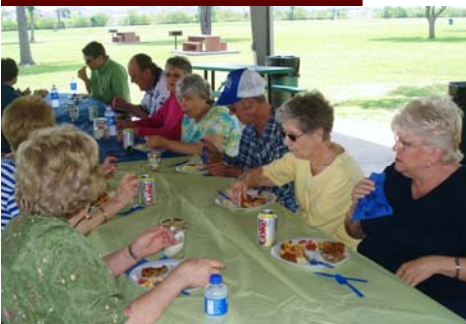
Young @ Heart enjoying a picnic lunch at a Katy park.