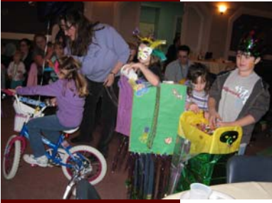
Mardi Gras fun!

Mark your calendars for September 18-19 th ! Holy Covenant will be celebrating 25 years of ministry and mission to the Katy community. Activities are planned for Saturday evening as well as a special worship service and lunch on Sunday. Whether you're a 20 year member or a new member you won't want to miss out on this historic celebration.