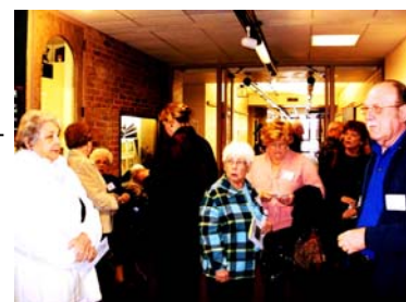
Young at Heart prepares to see and hear a collection of Rogers and Hart show tunes, presented at the College of the Mainland Theatre in Texas City.

And there’s more! March’s pot luck luncheon will be at 11:30AM on March 17 in Covenant Hall. AND...we will welcome Spring with a special picnic and day in the park on Wednesday, April 21 . We have reserved the covered pavillion in Harris County Katy Park (located at Morton Road and Katy-Hockley Cutoff) for the day!...Menu details, etc., will be available soon, but be prepared to enjoy lunch, and hang around for the games and fellowship to follow!