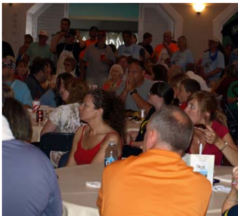
Waiting in anticipation as the winners are announced...

Our mission at Holy Covenant is "Meeting the Needs of People with the Power of Christ." We believe that the true strength and nature of any church is to be a fellowship of adults, youth and children who use their talents and faith for the causes of Jesus Christ. We invite you to come and to join us as you claim your place in ministry, feed your soul, make Christian friends, and celebrate the Love of God!