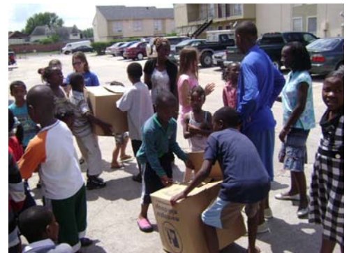
Thank you for your donations for the refugee families—they were so excited to open the boxes!