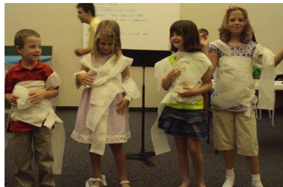
Having fun in KFC!!

July's Bible Verse: "Let anyone with ears to hear listen!" Luke 8: 8