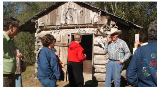
A peek at some Texas History in Gonzales, Texas

April 20 th will mark our second annual "Day in the Park" ... this time our picnic will be at Mary Jo Peckham Park in Katy. Fried chicken and drinks will be furnished but bring a side dish or dessert to share and come enjoy the spring weather, maybe a little fishing in the lake, walking the park's trails and just a great time to visit and relax.