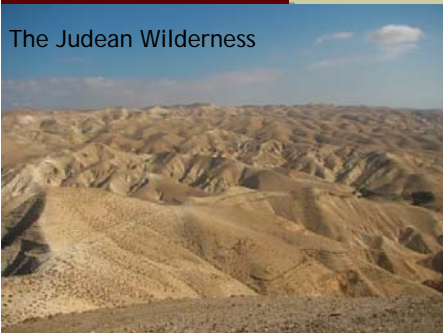
The Judean Wilderness