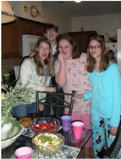
The girls had a blast having a pajama party, dancing, and watching movies at the January Girls' Night!